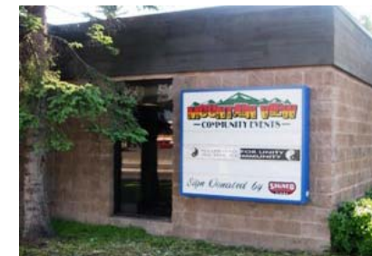
Our sign- repaired thanks to a donation from one of our generous businesses – SIGNCO!