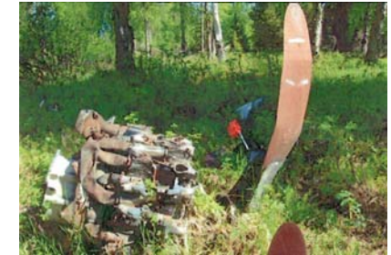
The B-26 Crash Site

Anti-Aircraft Firing Point: This site is approximately 1 acre in size and is located near Cairn Point .... Remnants of gun emplacements, ammunition storage bays, and concrete personnel bunkers were found but no explosive-related items were found during the investigation.