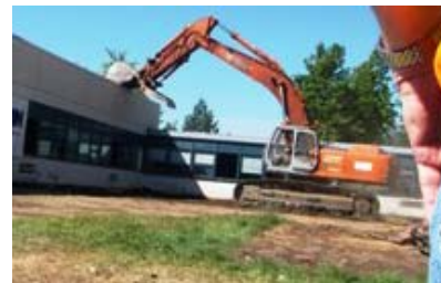
Getting ready for countdown from the kids and taking the first bite

B-26 Crash Site: This site is approximately one half acre in size and contains airplane wreckage from a B-26 that crashed in the 1940s. This site is remote and access is limited. Three empty .50 caliber casing were discov-