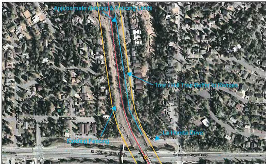
The project corridor is approximately 1200 feet long, and adjacent to the Forrest Park neighborhood.