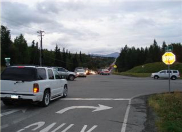
Morning Commute at Rabbit Creek Rd. and Goldenview Dr.