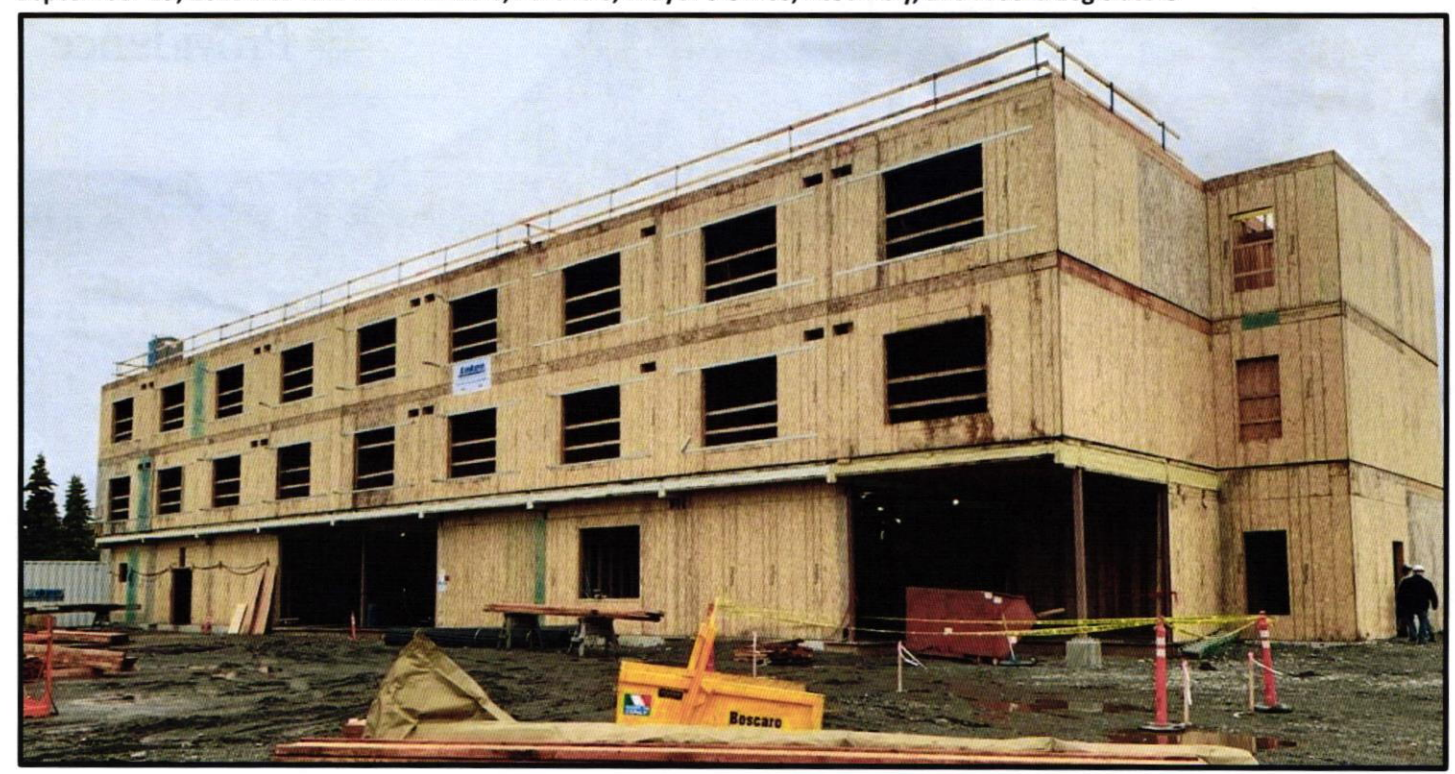
September 15, 2023 site tour with Funders, Partners, Mayor's Office, Assembly, and Alaska Legislators